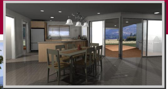
Graphic is an example only. Refer to specifics in quotation for actual inclusions.